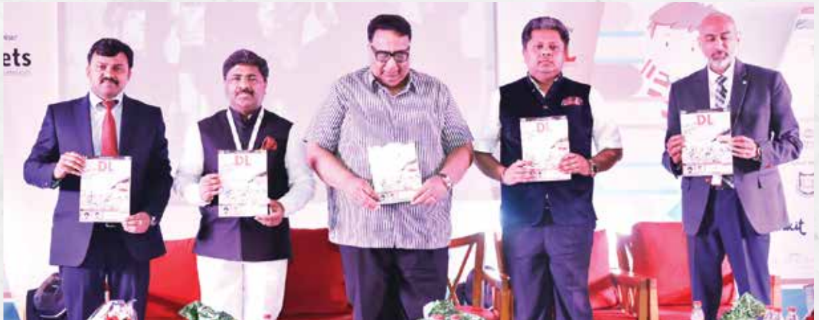
Magazine Launch at 7th School Leadership Summit, Chandigarh

"The initial priority of education was to make good human beings. But today the priority is to make our children more skilled to be a good job seeker or to be successful. Five basic challenges of education are: to raise the status of teaching as a career choice, to reduce the disparity between the schools of India, to redesign the curriculum and inculcate technology in that, flexible learning arrangements in education and to identify the children who are at risk of falling behind."