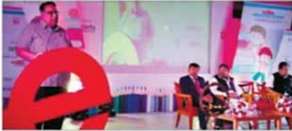
7th Elets School Leadership Summit underway in Chandigarh on Saturday.