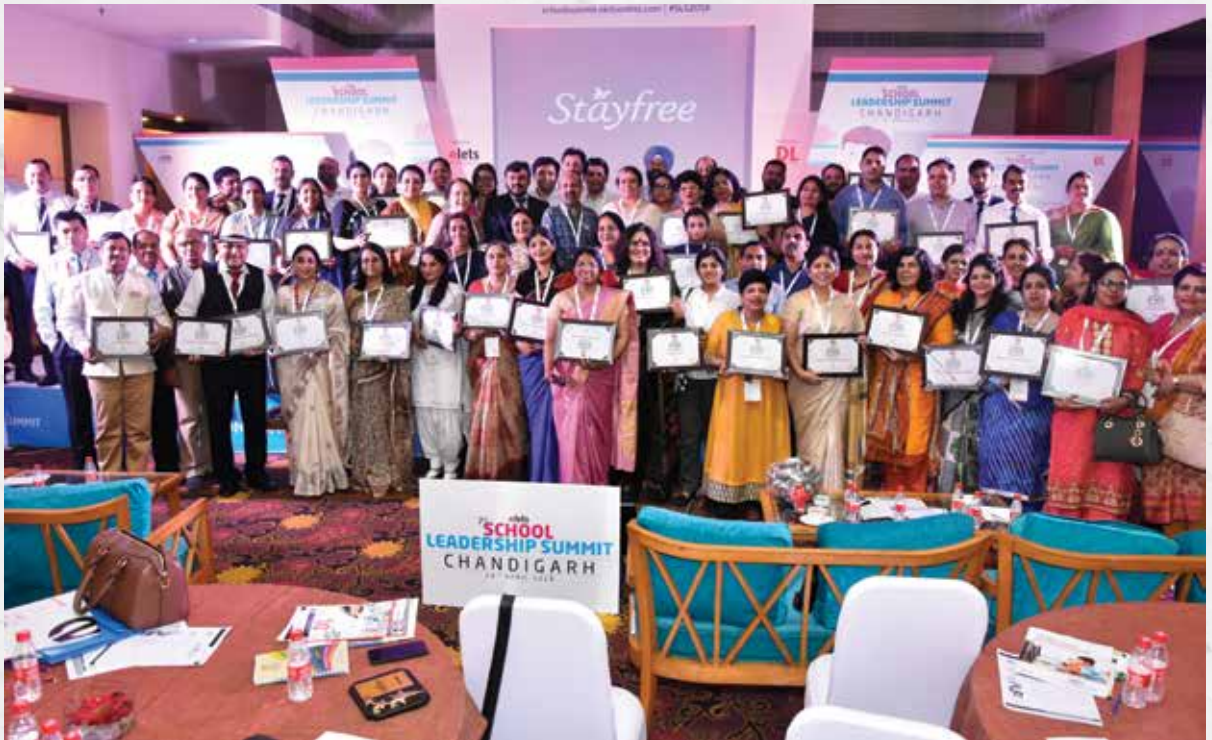
Felicitation of Top Schools of Chandigarh, Haryana, Punjab and Himachal Pradesh