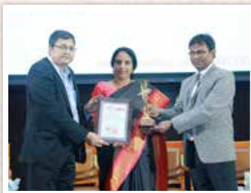
Jubilee Hills Public School, Hyderabad, India