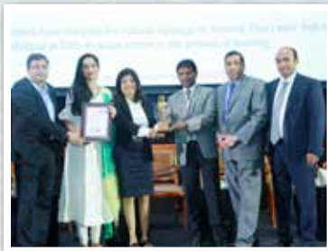
Global Indian International School (GIIS), Bangalore