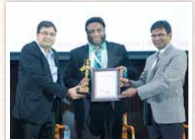
Oyster Advisory Services Pvt. Ltd.