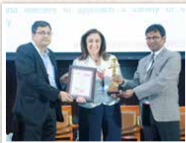
GEMS Wellington International School, Dubai