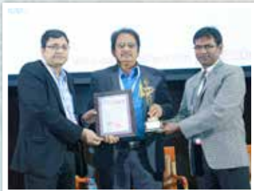
LearnEngg - for the Technical and Vocational Education