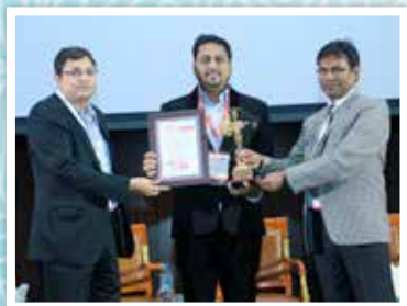
Indira Gandhi Computer Saksharta Mission (IGCSM)