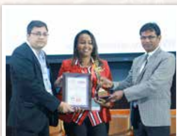
Red Bus Nursery, Ras Al Khaimah