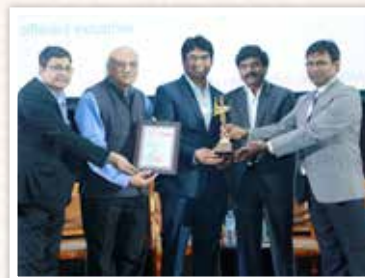
Dr C V Raman University, India