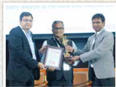
Vidyabhawan School, Keonjhar, India