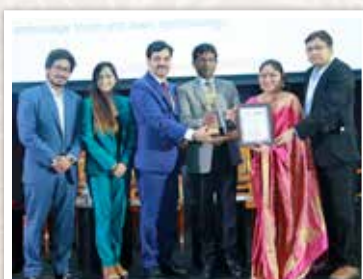
Sanfort Group of Schools