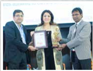
British Orchard Nursery, Dubai