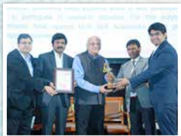
AISECT University, India