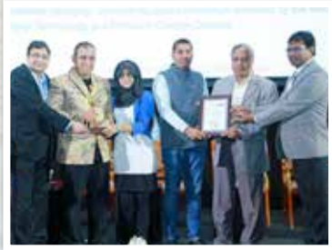
3G App AI Design in Future Education