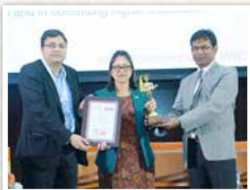
American University in the Emirates