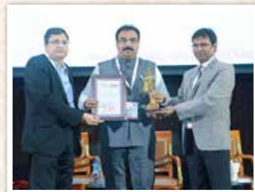
Sacred Heart School, Kalyan, India