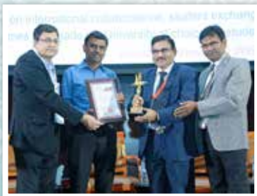
Manipal University, Dubai