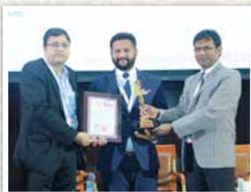
Trio World School, Bagaluru, India