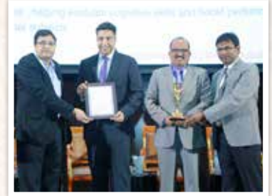
Gold Infotech FZC.JPG