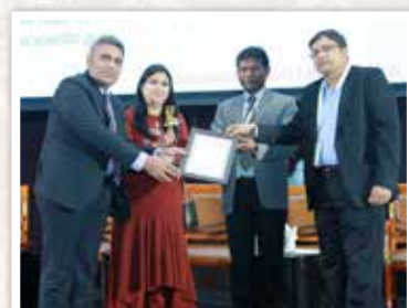
Superkidz @ Holy Heart, Amritsar