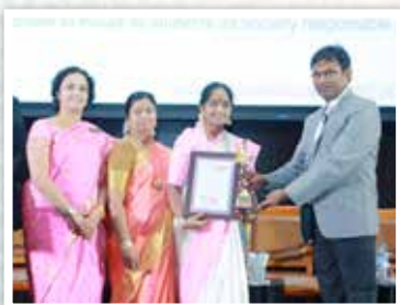
Dr MGR Educational and Research Institute, India