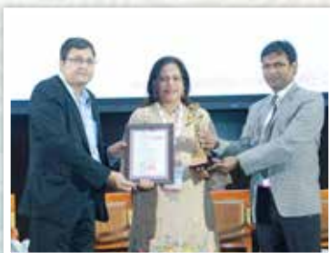
SNBP Group of Institutes, India