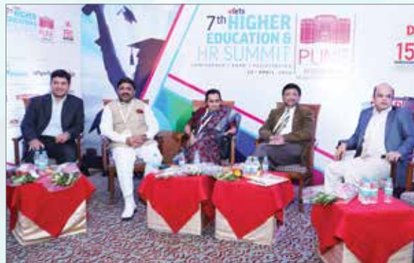
Inugural Session at 7 th HE HR Conclave, Pune