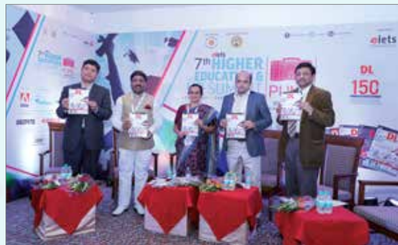
Magazine launch at 7 th HE HR Conclave, Pune

“I would like to draw your attention towards the education scenario in the country. We have 1,335 million people in this country and only 30 million people are getting education degree of that may be four million are getting education degree and may be around 1.5 lakh are doing a PhD. The stats shows that four percent in this country are getting undergraduate degree, 0.4 per cent are postgraduate and around 0.01 per cent are research scholars.”