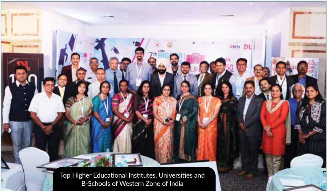
Top Higher Educational Institutes, Universities and B-Schools of Western Zone of India