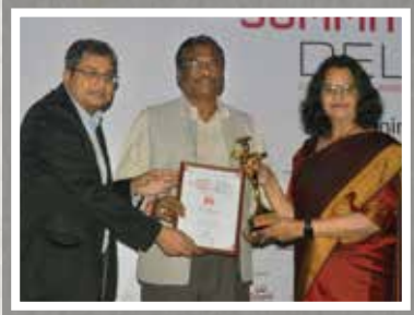
Indian School Sohar, Sohar Oman