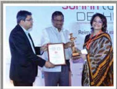
Indraprastha International School Sector 10, Dwarka, New Delhi