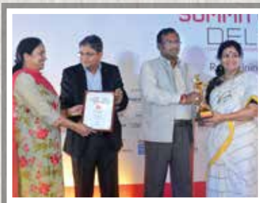
The Orchid School, Pune