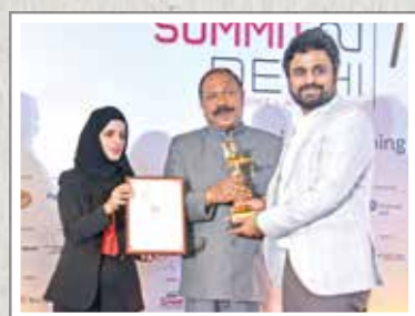
Mosaic Network India Pvt Ltd