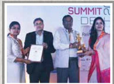
Sir Padampat Singhania Education Centre, Kanpur