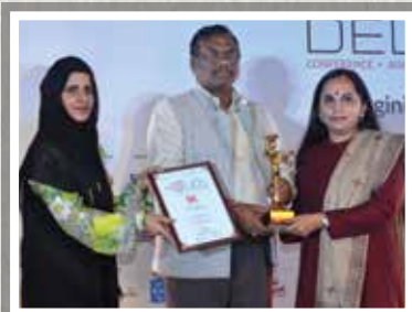
The Millennium School Surat