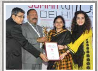
Oi Playschool, Hyderabad