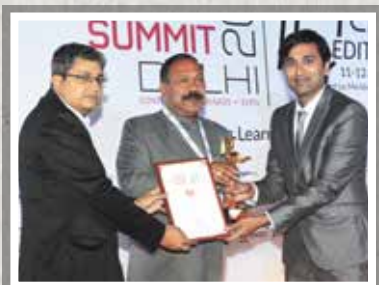
Fundo Kidz Tecvid Software Consultancy Pvt Ltd