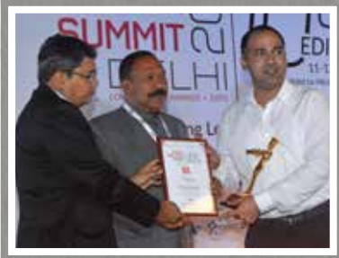
District Collector and Magistrate Collector Office, Jhalawar