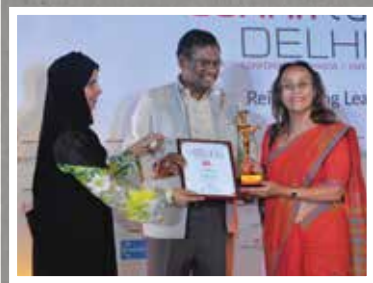
St Marks Sr Secondary Public School, New Delhi