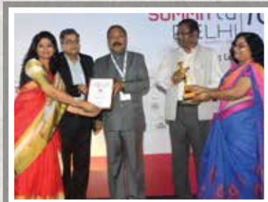
Oakridge International School, Einstein Campus, Hyderabad