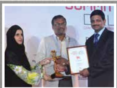
Vibgyor High, Marathahlli Bangalore