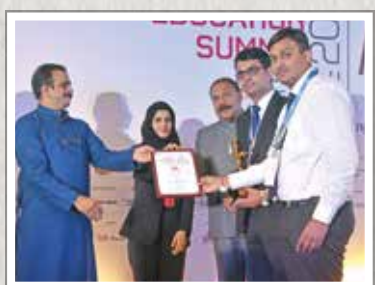
Mahendra Skills Training and Development Pvt Ltd