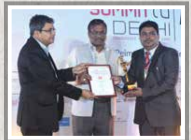
Edify School, Nagpur