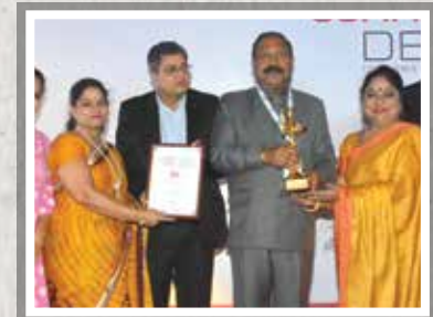
Sanfort Group of Schools