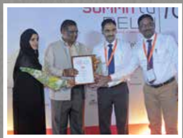
Vidhyashram International School, Jodhpur