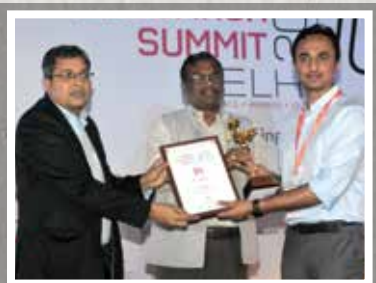
The Geekay World School, Vellore