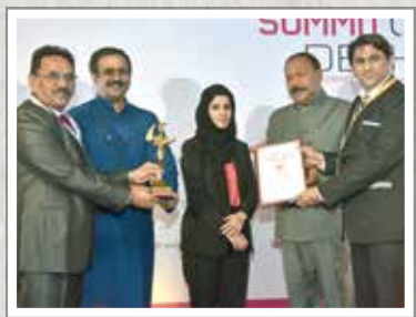
Priyadarshini College of Engineering,