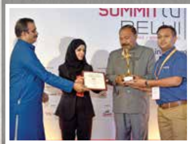
IIBM Institute of Business Management Meerut