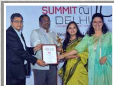
Billabong High International School, Noida