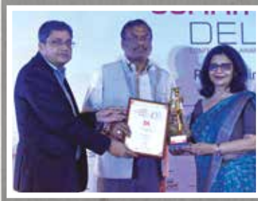
Royal Global School, Guwahati