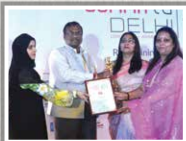
Indian Hights School, Sector 23, Dwarka, New Delhi