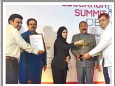
Jointeca Education Solutions Ltd