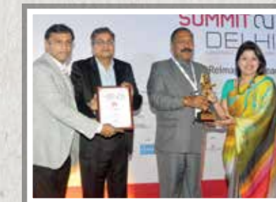
Petals Group of Schools