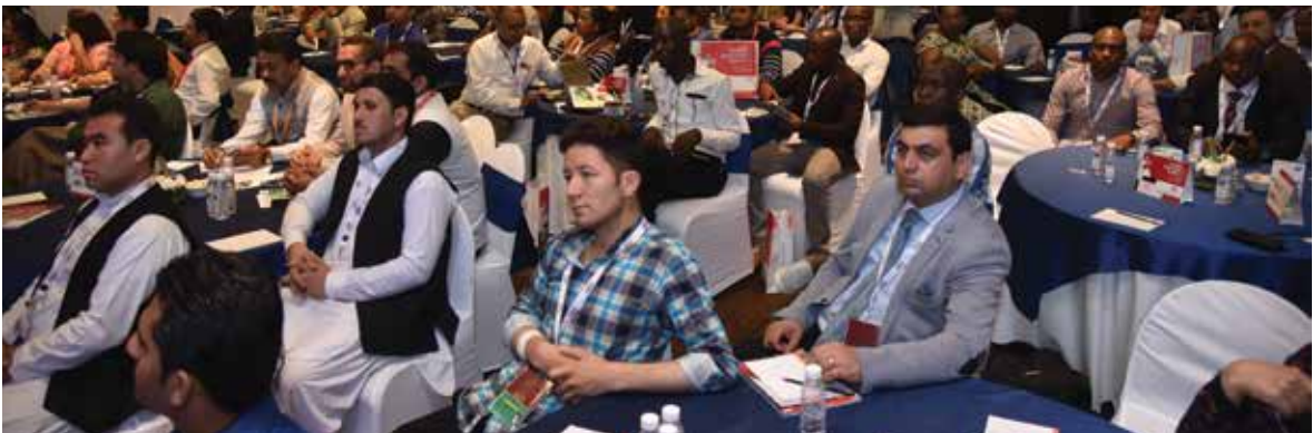
Participants at the WES attending discussions

“Education is not only about being literate. It is about developing a child’s personality in a way that he or she can acquire knowledge. We all are contributing for the same. We also have to focus on infrastructure along with improving the higher education scenario.”