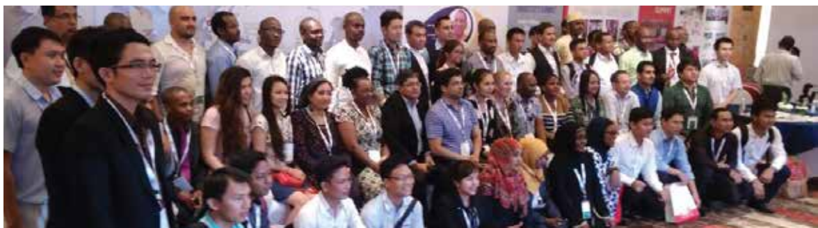
Participants from different parts of the world