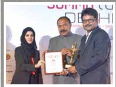
Indiannica Learning Private Limited