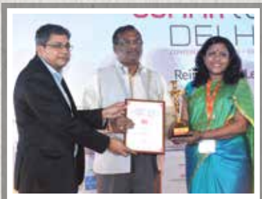
Anand Niketan Bhadaj Campus, Bhadaj Ahmedabad