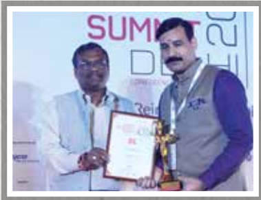
Bitt VR World School, Ranchi