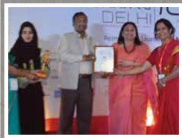
Seth Anandram Jaipuria School, Kanpur