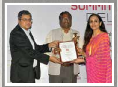
Sri Venkateshwar International School, Sector 18, Dwarka, New Delhi