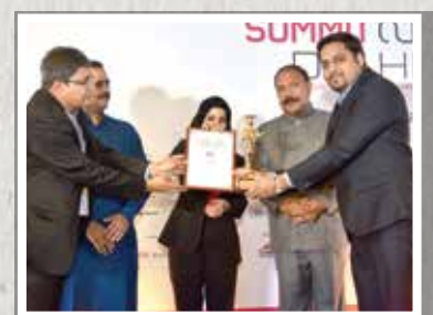
Indira Gandhi Computer Shaksharta Mission