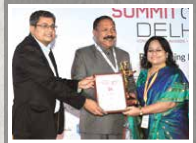
Childrens Academy, Malad Mumbai