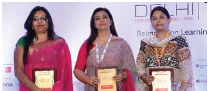
Participants of HR conclave at the summit

This was the first time WES included a special session -- HR Conclave -- to discuss employability related issues, the gaps between industry demands and skills and hiring processes etc. The industry presentations during the summit highlighted the scope of technology and its effects in the education sector, need for skill development in the country and more participation of corporate for betterment of education landscape.