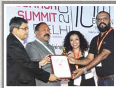
Safari Kid International Preschool