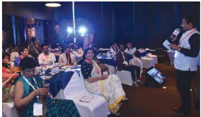
Audience at the summit

The two-day conference was divided into two parallel sections: School Education and Higher Education. The school education witnessed various brainstorming sessions including Leveraging Collaboration, Building Effective School Education Ecosystem; Technology Accessibility in the Classroom: Creating Inclusive Learning Experiences for Students, Trends in Education in India and many more.