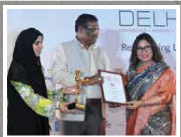
Mussoorie International School Mussoorie