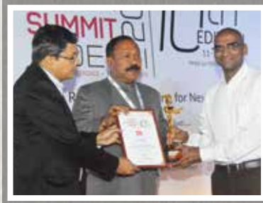
Telangana State Welfare Residential Educational Society, Government of Telangana