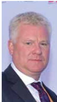
Paul Fear CEO, British Accreditation Council, United Kingdom