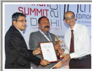
Global Indian International School Pte Ltd, Singapore