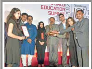
Marg ERP Ltd