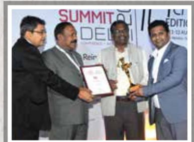
Trio World School, Bangalore