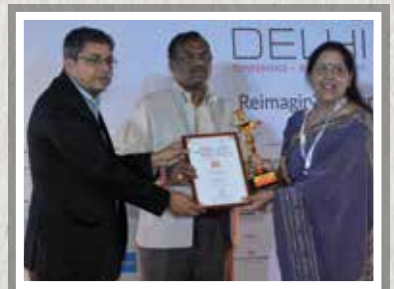
Manav Sthali School, New Delhi