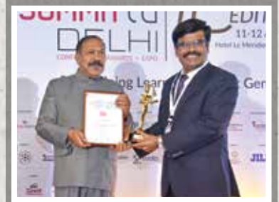
Kalaingar Karunanidhi Institute of Technology, Coimbatore