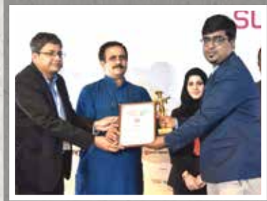
ConveGenius Edu Solutions Pvt Limited