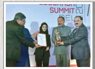
Prestige Education Society, Indore