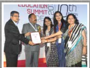
Delhi International School, Sector 23, Dwarka, New Delhi