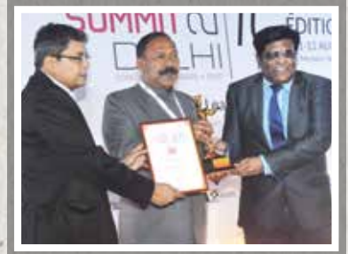
Board of Intermediate Education, Government of Telangana