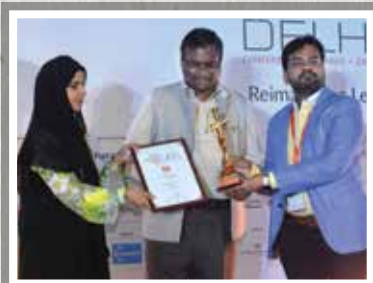
Different Convent School Bathinda