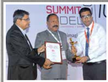
Gurukul The School Ghaziabad