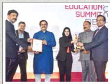
Apeejay Styta University