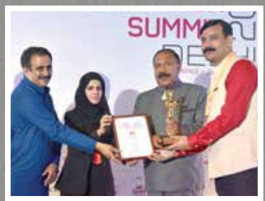
Bitt Polytechnic, Ranchi