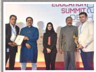
Naesys Dimensions Solution Pvt Ltd