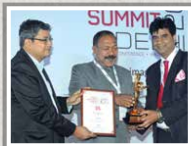
Brats n Cuties