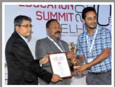
Shemrock Sr Secondary School S A S Nagar, Punjab