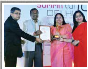
Seth Anandram Jaipuria School Ghaziabad