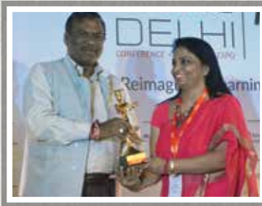
Allenhouse Public School Ghaziabad