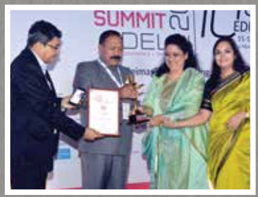
Kangaroo Kids PreSchools