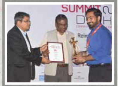
Satluj Public School, Panchkula