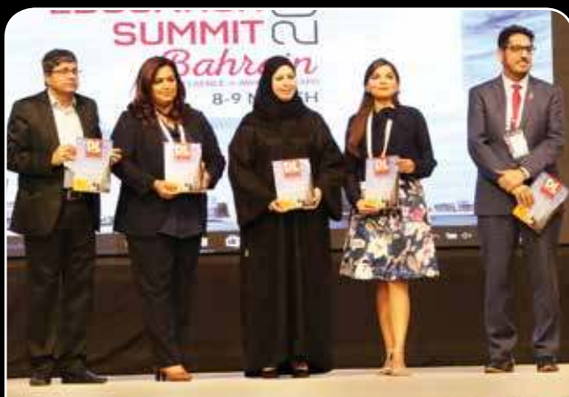
Eduleaders showcasing the special issue of Digital Learning magazine on WES Bahrain.