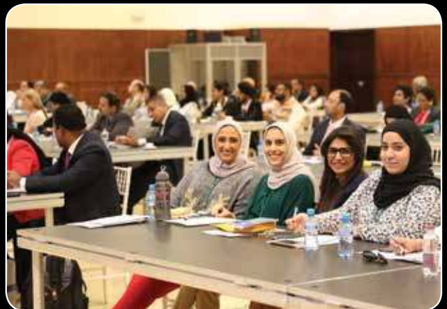
Global eduleaders and education stakeholders participating in the summit.