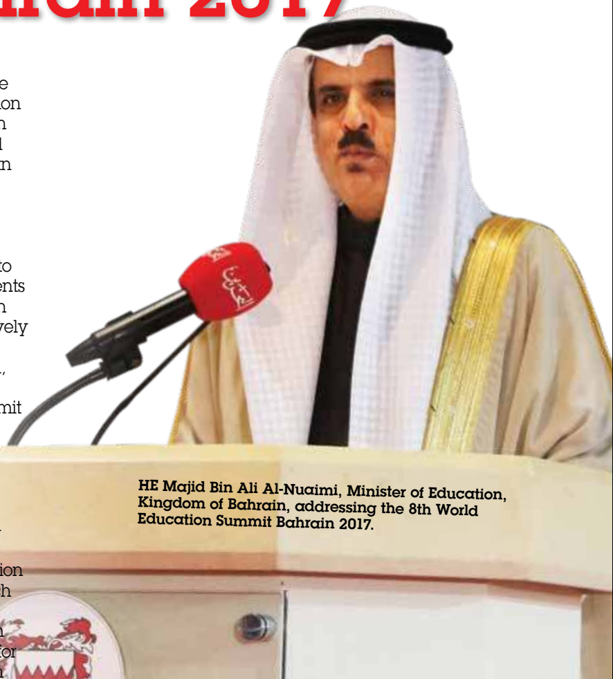
HE Majid Bin Ali Al-Nuaimi, Minister of Education, Kingdom of Bahrain, addressing the 8th World Education Summit Bahrain 2017.

Divided into segments like School Education and Higher Education, innovative ideas such as modernising education policy through positive education, collaborative learning in globalised environment, growing demand for private education in Bahrain and education