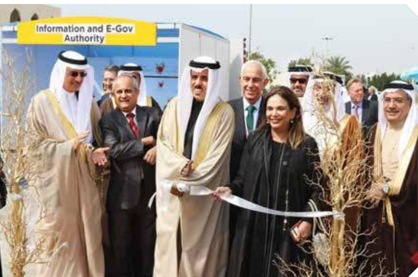
The Minister of Education, Kingdom of Bahrain, inaugurating the 8th World Education Summit Bahrain 2017 on March 8.

for skill fulfillment: global experiments emerged as the key themes around which the discussions were held at the summit.