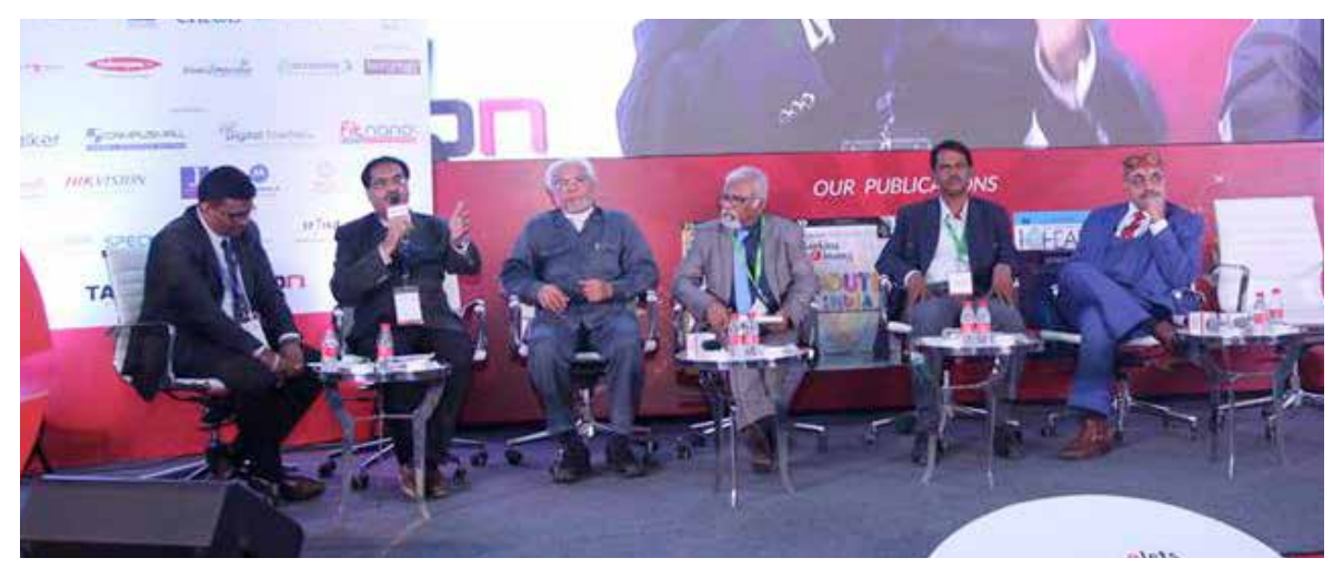
Education for Human Fulfilment -- The Emerging Global Experiments & Innovations