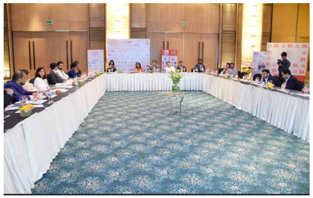
Roundtable with Government of Rajasthan