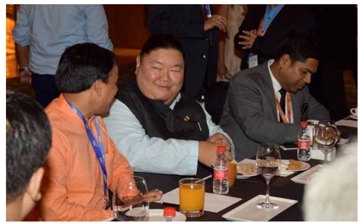
Roundtable with (on the Left) Higher Education Minister, Government of Uttarakhand, and (on the Right) Minister, Higher & Technical Education, Government of Nagaland