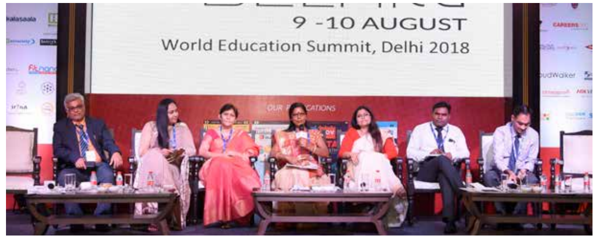
Building Leadership and Innovation in K-12 Education and Training