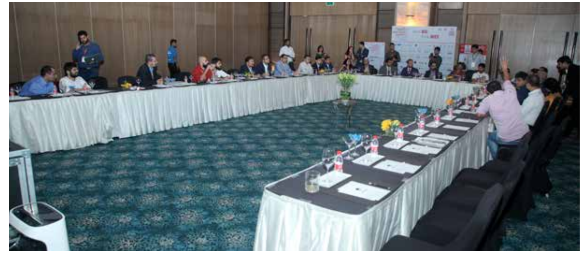
Roundtable with corporate