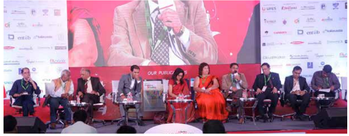
The Game Changer for Higher Education Scenario