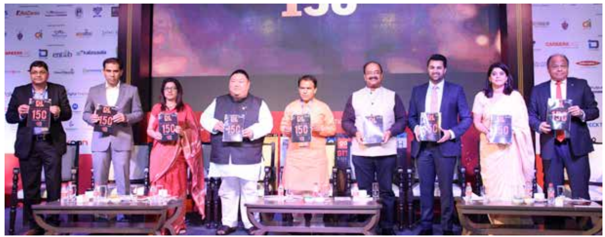
Launching of digitalLEARNING's 150th issue at the summit

We engage with education sector in this country through our display and projection solutions. This is one of our core businesses we are doing in Japan and Asia Pacific. Whether it is projector technology or integration of these technologies, we are the top brand. In education sector, we work more in developing display solutions with some of the most renowned schools of the country.