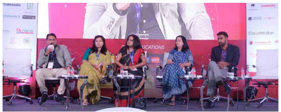
HR Panel Discussion -- HR's Role in the Changing Scenario of Employment, Innovation & Entrepreneurship in New Era