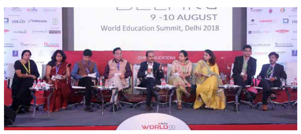
Meeting the changing behaviour of student enrollment and the impact of technology