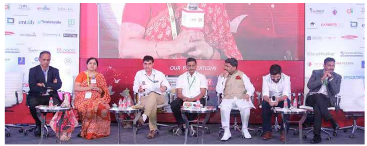
Importance of PPP model in Education