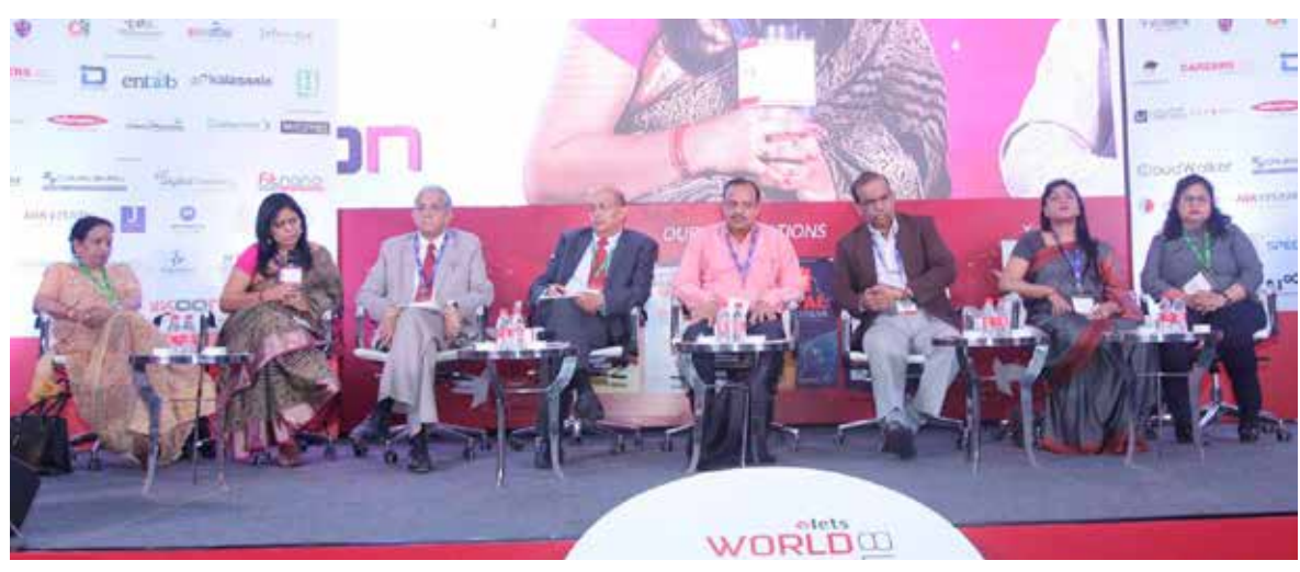
The New Age Disruptors of Global Business Education