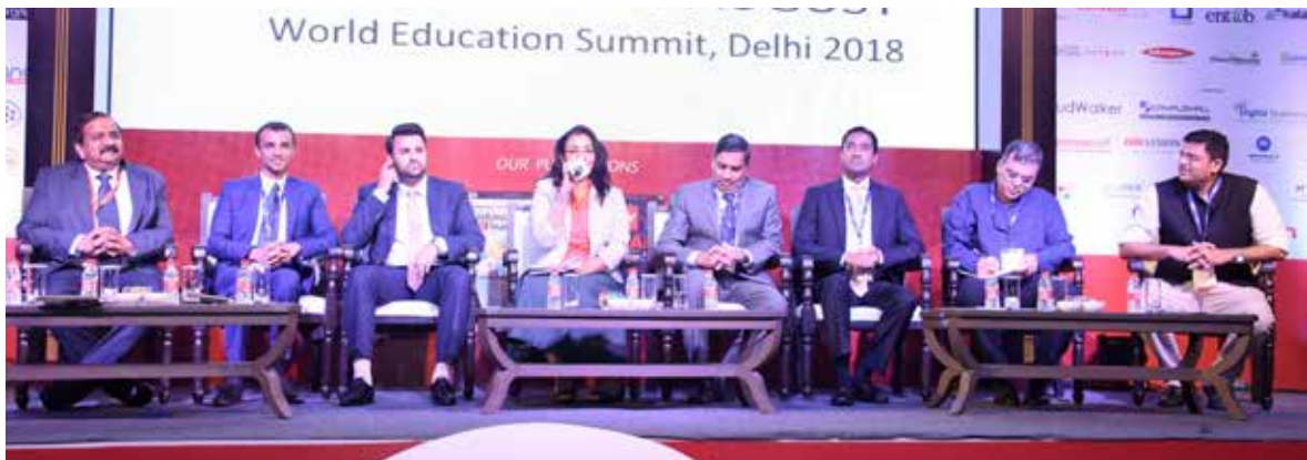
Adjustment vs Variety - 21st Century Leadership Challenge