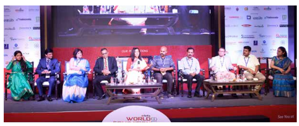
How Co-curricular activities supplement and complement the curricular