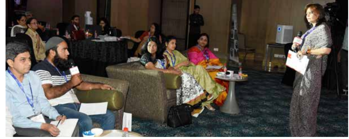
Creative blending of traditional pedagogical approaches with digital contents and technology for school education