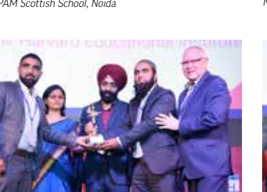
Kashmir Harvard Educational Institute, Srinagar