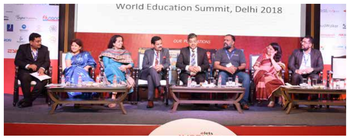
Preschool Panel Discussion - Dynamics of Emotional Cognitive Social Early Learning (ECSEL) & Growth Opportunities for Pre Schools