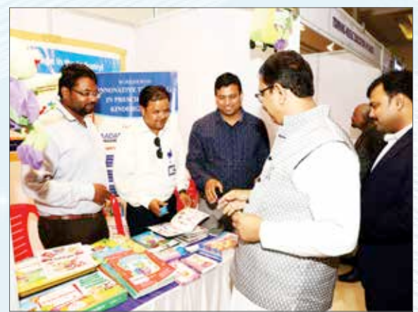
Presetations in the expo at 8th School Leadership Summit Indore