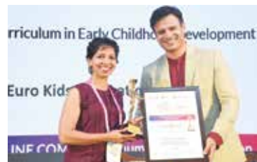
Euro Kids International, Innovation in Curriculum in Early Childhood Development