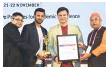
Ram Krishna Vidya Mandir, Gwalior Innovative Practices for Academic Excellence