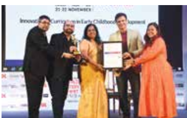
Little Red Bus Global Preschool, Emerging Preschool Chain