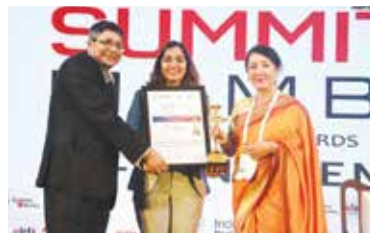
Fravashi International Academy, Nashik, Innovative Practices for Academic Excellence