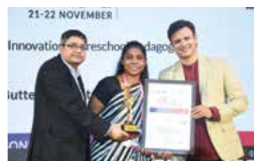
Williez Pre-School, Mumbai, Innovation in Curriculum in Early Childhood Development