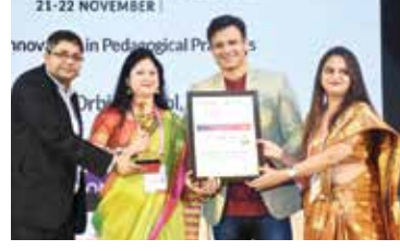
Seth Anandram Jaipuria School, Kanpur, Innovation in STEAM Education