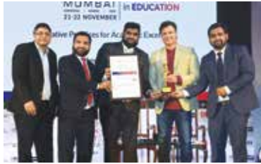
ACN International School, Aligarh Innovative Practices for Academic Excellence