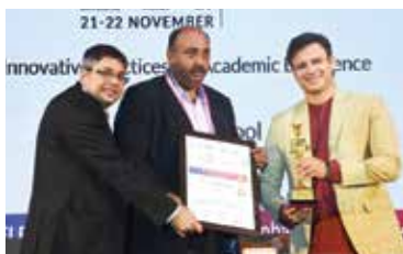
J S Public School, Chandauli, Innovative Practices for Academic Excellence