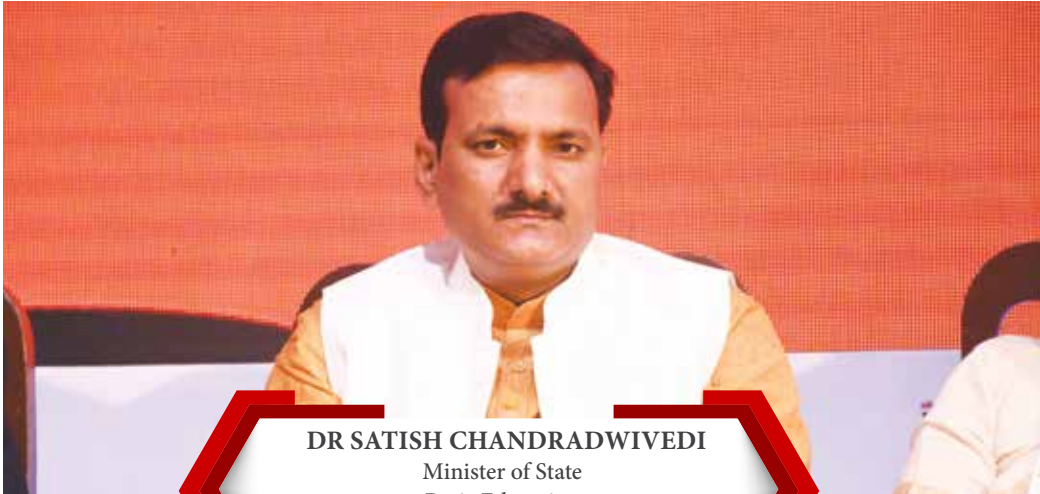
DR SATISH CHANDRADWIVEDI Minister of State Basic Education Government of Uttar Pradesh

There has been a paradigm shift in our education system, if we compare it to the gurukul system of the past. The present system of education focuses more on virtual classrooms. For example, a scheme called 'Kayakalp Yojna' has been launched in the state of Uttar Pradesh which is encouraging parents from financially sound backgrounds to send their children to government schools. This scheme has been instrumental in transforming the face of schools in terms of infrastructure, better facilities and providing quality education.