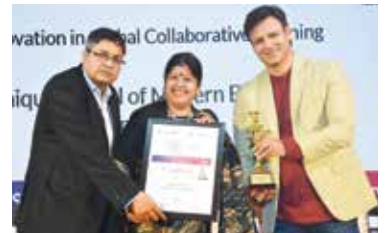
Euro School, Airoli, Teaching Excellence in Sports