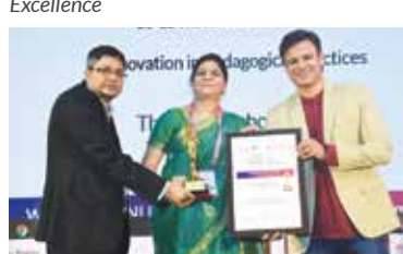
The Orbis School, Pune, Innovation in Pedagogical Practices'