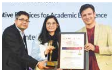
Sagar International School, Bhopal Innovative Practices for Academic Excellence