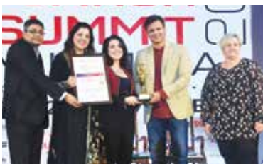
British Orchard Nurseries, UAE & UK, Innovative Preschool Enterprise