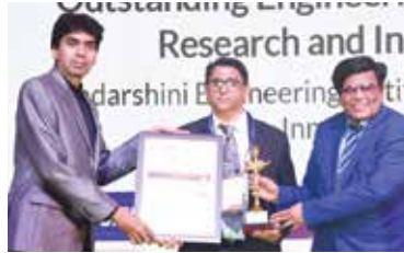
Priyadarshini College of Engineering