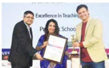
Thakur International School Cambridge, Mumbai, Innovative Practices for Academic Excellence