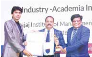
G L Bajaj Institute of Management and Research