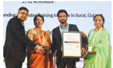
Outstanding Computer Training Institute in Surat, Gujarat Dreams Design Institute